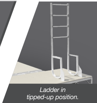
Ladder in tipped-up position.