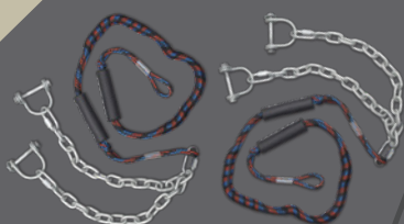
DOUBLE ANCHOR CLEVIS KIT