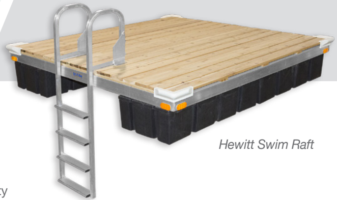
Hewitt Swim Raft

Always at the center of fun – swimming, diving and sunbathing. This durable 8' x 8' platform is solidly built and virtually unsinkable. Weighs 340 lbs. with a 1400 lb. capacity. Custom sizes also available.